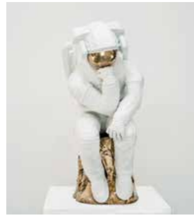
Joseph Klibansky The Thinker, 2018 Signed Polished bronze, spray paint.

130 x 250 cm 51 1/8 x 98 3/8 in (ZHO210)