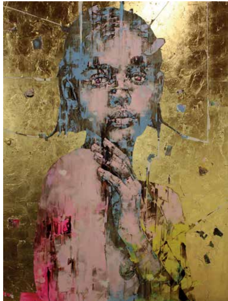
Marco Grassi The Di-Gold Experience 250 - 79, 2020 Oil and resin on aluminium with 24K gold leaf.

200 x 150 cm 78 3/4 x 59 1/8 in (MGR097)