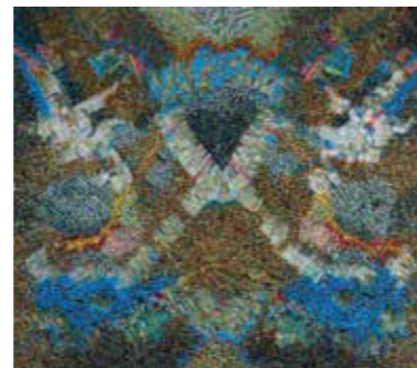
Ilhwa Kim Space Station 5, 2020 Hand-dyed hanji paper.

224 x 192 x 15 cm 88 1/4 x 75 5/8 x 5 7/8 in (IKI069)